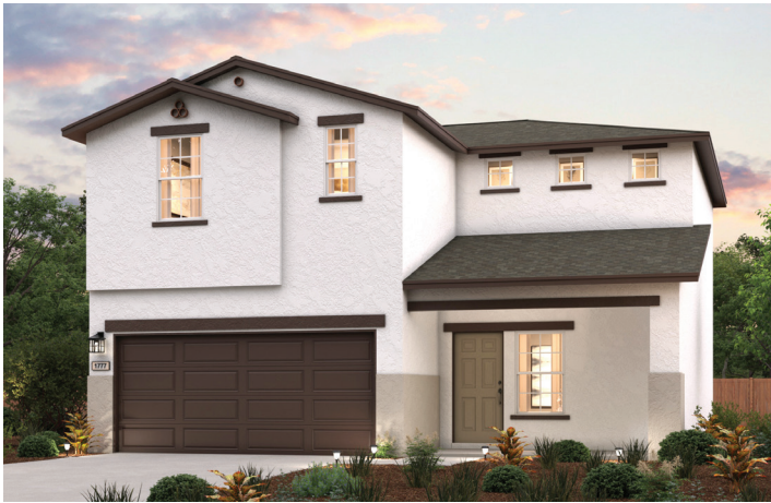
ELEVATION A - EARLY CALIFORNIA

APPROX. 1,777 SQ. FT. | 2-STORY | 3 BEDROOMS | 2.5 BATHROOMS | 2-BAY GARAGE