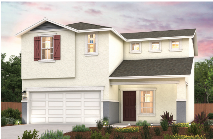
ELEVATION C - COTTAGE