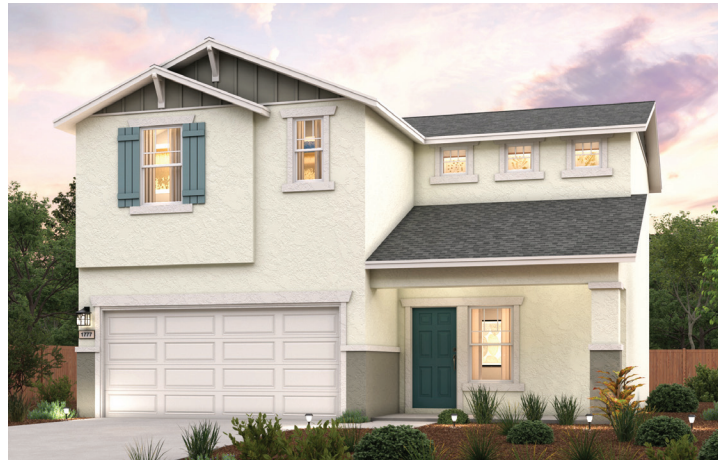
ELEVATION B - BUNGALOW